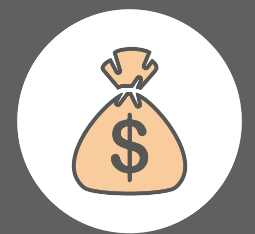
LIVELIHOODS & INCOME