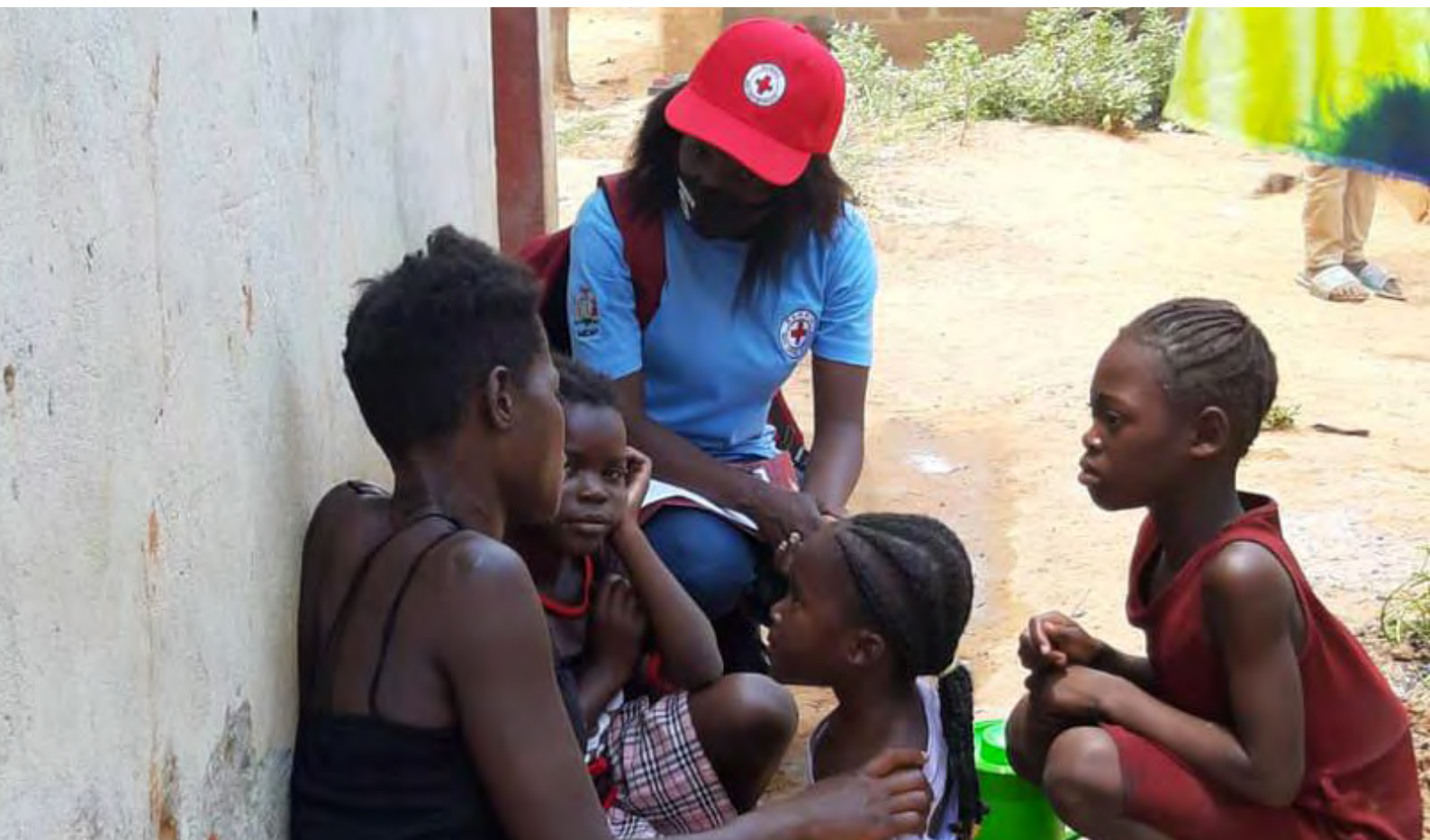
November 2020, Zambia Red Cross Society carrying out social mobilisation activities for a Measles/Rubella campaign to improve immunisation coverage in the country

The Italian Red Cross supports the Zambia Red Cross with branch development through income-generating activities in the Mungwi, Mansa and Lusaka branches. It is not currently present in the country.