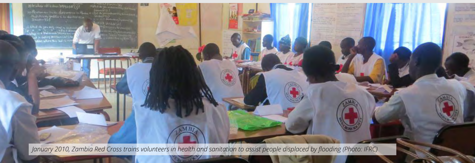
January 2010, Zambia Red Cross trains volunteers in health and sanitation to assist people displaced by flooding